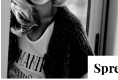
Spread some inspiration, GCC FRONTLINE F : combining style and philanthropy