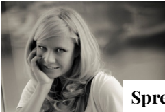
Spread Some Inspiration campaign 2012 – Philadelphia women of inspiration gcc