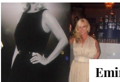
Emirates Woman of the Year Awards 2011