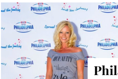
Philadelphia women of inspiration GCC – 2011