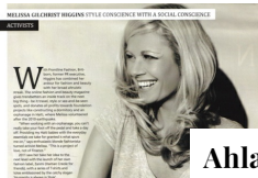
Ahlan Hot 100 – 2012