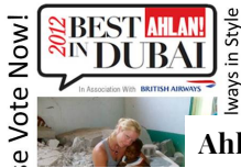
Ahlan Best in Dubai 2012